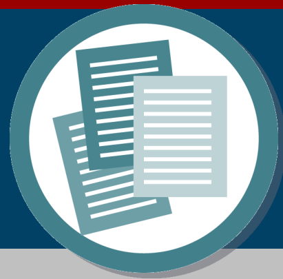
Number of Policies by Entity

* Policies identified and evaluated for integration opportunities address conditions or terms of employment. Programmatic policies were not selected for integration opportunities.