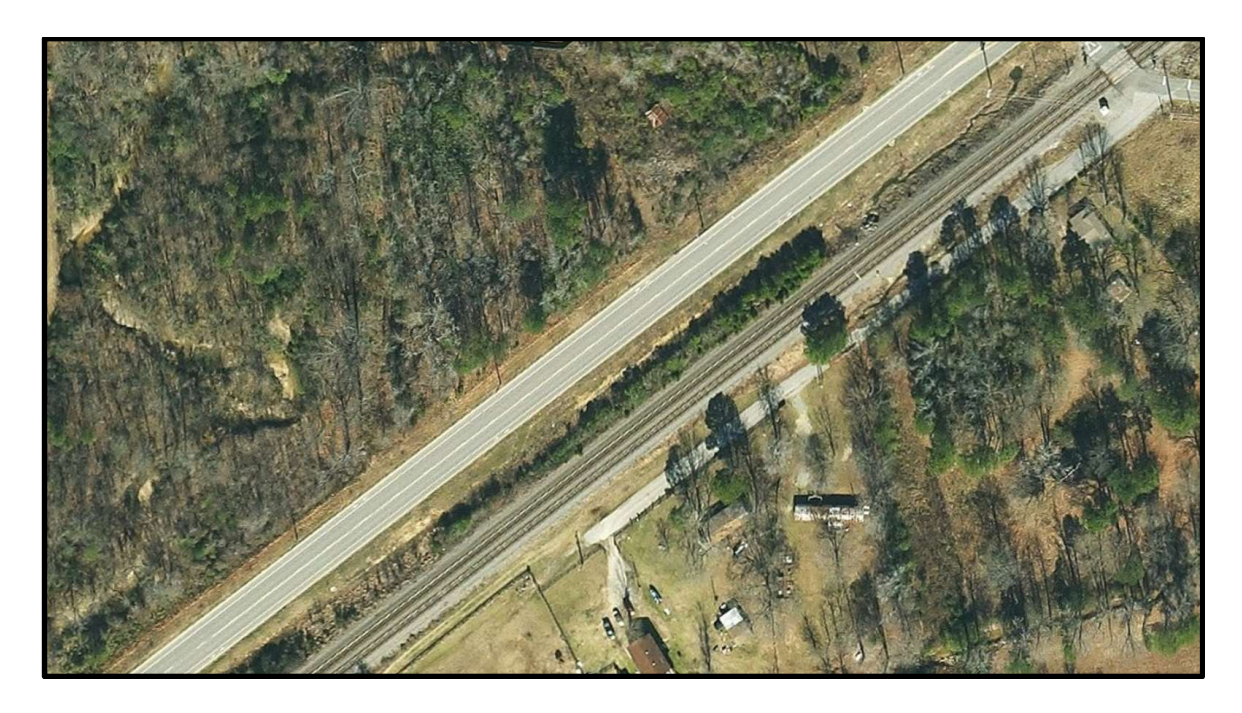
Situs - The proper or original position of a specific location. An element that designates a fixed site, such as the address of a property or building.

Stream Mode - Points are collected on regular intervals or time or distance.