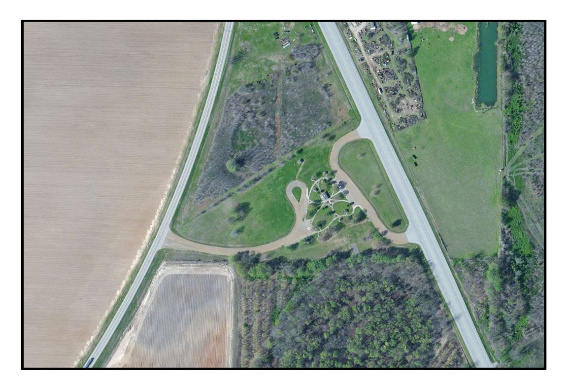
Example: Weight Station