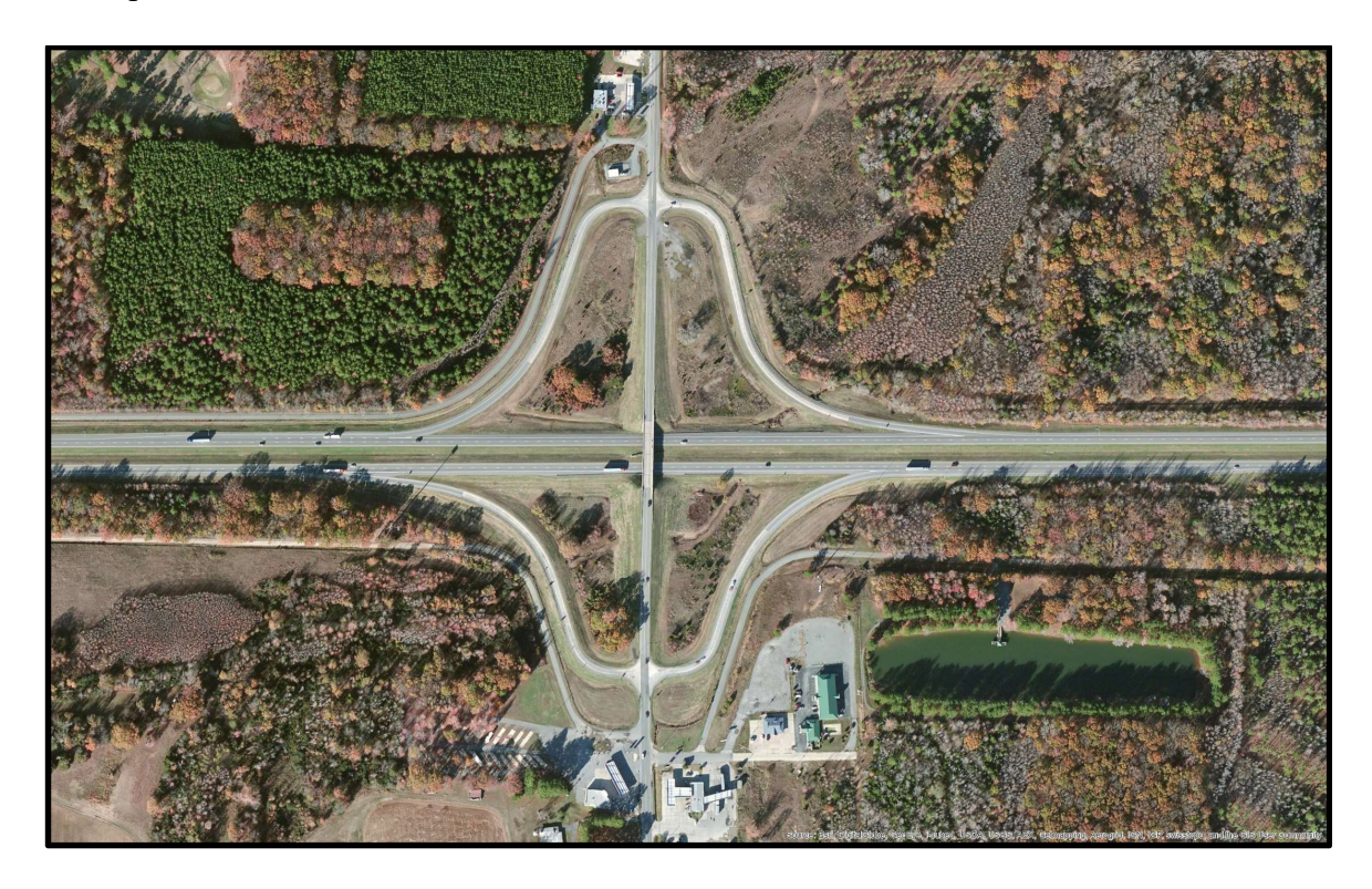
Highway Facility - Generally, these are public service facilities located along freeways and highways. Often similar in design, these may include weigh stations, welcome centers, overlooks, truck parking areas, and rest areas.